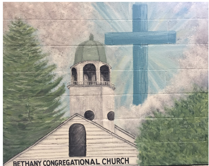
Mural in the Fellowship Hall

If you enjoy The Bell Tower and you would like to see your name here, please send a small donation to Bethany Church. It helps to offset costs. Thank you.