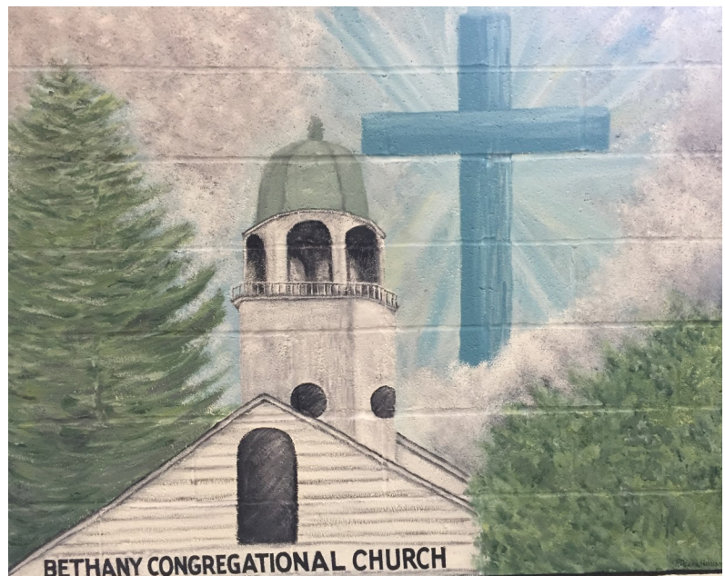
Mural in the Fellowship Hall