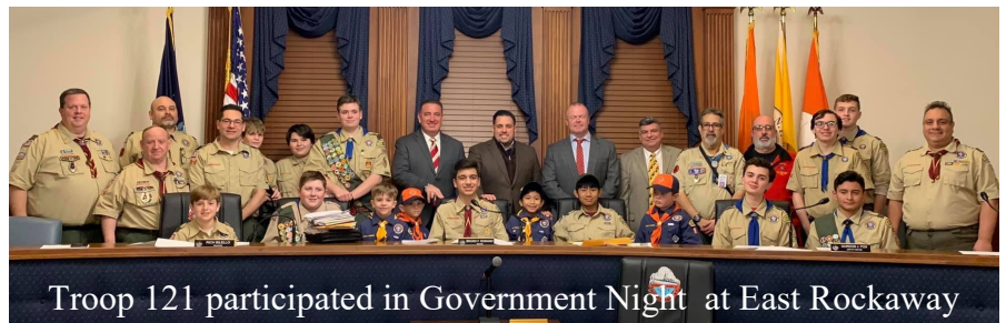
Troop 121 participated in Government Night at East Rockaway Village Hall on Monday, February 10. St. Raymond's Troop 332 and Pack 84 also participated.

February 25...Anti-Racism Workshop February 26...Ash Wednesday March 8...Begin Daylight Savings Time March 15...Women's League Meeting March 17...St. Patrick's Day March 19...First Day of Spring March 22...One Great Hour of Sharing April 4...Spaghetti Dinner (Men's Club) April 5...Palm Sunday April 12...Easter Sunday April 19...Hygiene/Health Kits collected May 10...Mothers' Day...Blankets