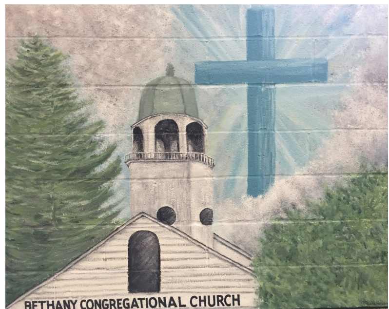
Mural in the Fellowship Hall